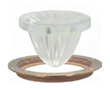
2415 Deep Frame Melon