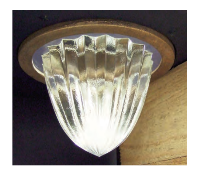
2414 Deep Frame Oblong