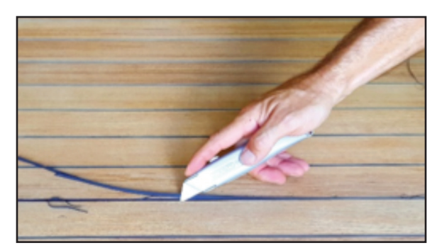
1. Old or damaged caulking can be removed with a razor knife, taking care not to damage the wood fiber.

When caulking, the ambient temperature should be between 40 - 90°F (5-33°C). In the tropics, work in a shaded area to prevent "bubbling" of caulk due to extreme deck temperatures. At lower temperatures, additional curing time is required because there is typically less humidity.